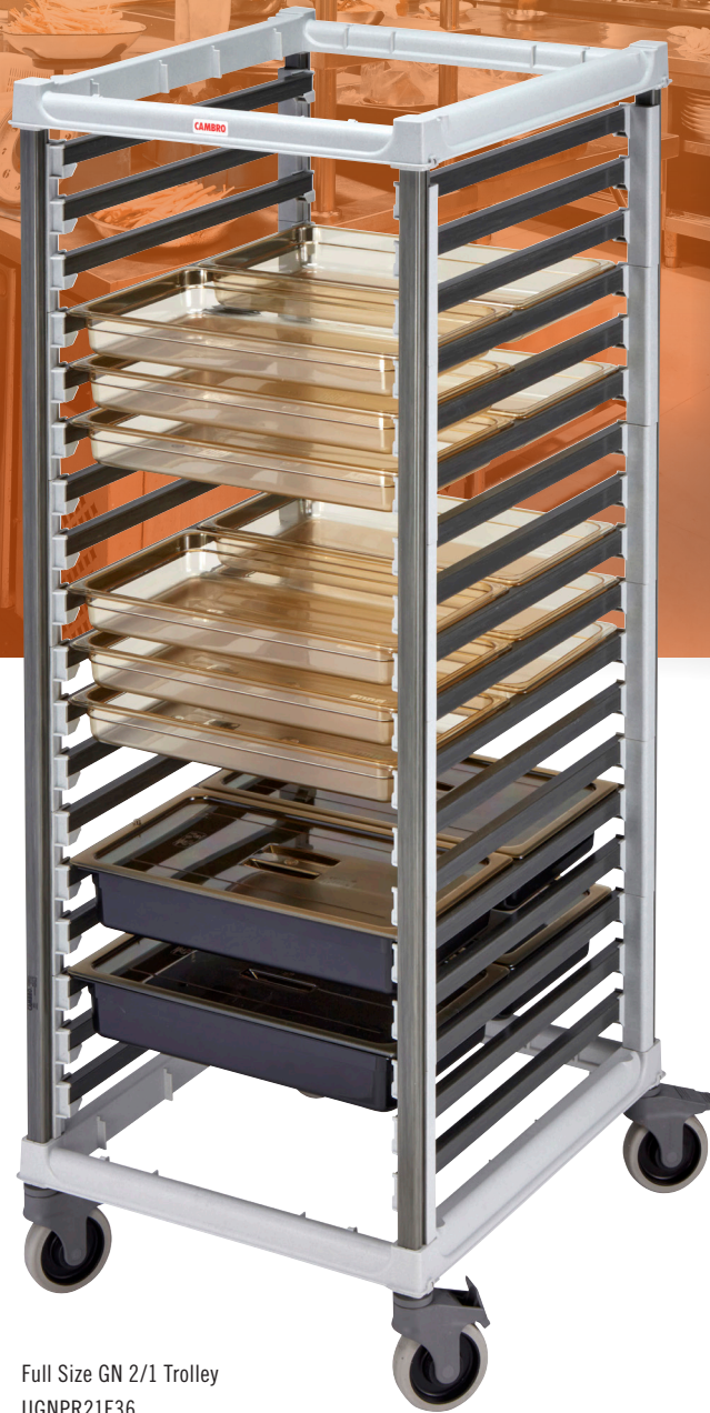
Full Size GN 2/1 Trolley UGNPR21F36