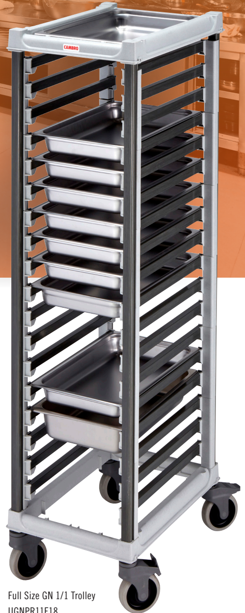
Full Size GN 1/1 Trolley UGNPR11F18

Lifetime Warranty Against Rust and Corrosion