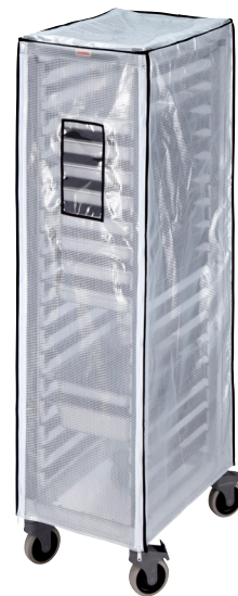
GBCTUGNPR11 Optional Heavy Duty Vinyl Cover for GN 1/1 Full Size Trolley.

All Trolleys ship knockdown (KD) complete in 1 box with casters and bottom frame wedges factory assembled on posts.