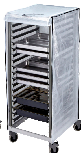
GBCTUGNPR21 Optional Heavy Duty Vinyl Cover for GN 2/1 Full Size Trolley.